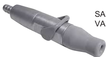
SALIVA EJECTOR VALVE