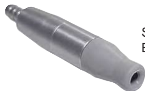
SALIVA EJECTOR BODY

Note: Replacement o-rings 0015-010 & 0015-308 (#8), see pg. 78 & 79